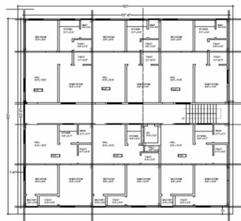
FIG 5.1 BUILDING VIEW OF PLAN